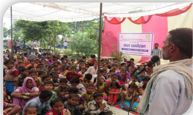
Children's during Bal Sammellan

Nearly 200 children of 10 villages, teachers from schools, guardians and numerous villagers were taken part in the event. In this way, the children also presented their talents by singing a song, reciting poems and jokes, telling stories etc.