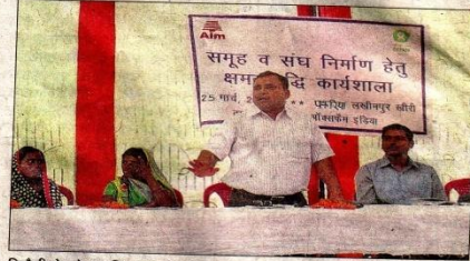
मितीली क्षेत्र के पकरिया गांव में रविवार को आयोजित कार्यशाला का नाबाई के अधिकारियों ने सम्बोधित किया।