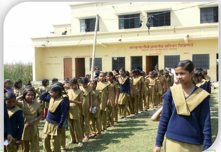
Girls during rally in Tulsipur Block, Balrampur