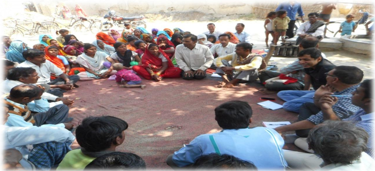
Action Aid country Director interact with community members in Block Mitauli, Kheri