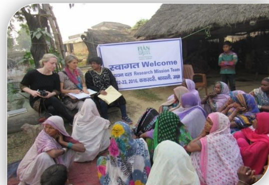
Research Mission Team in village Kakardari, District Shravasti