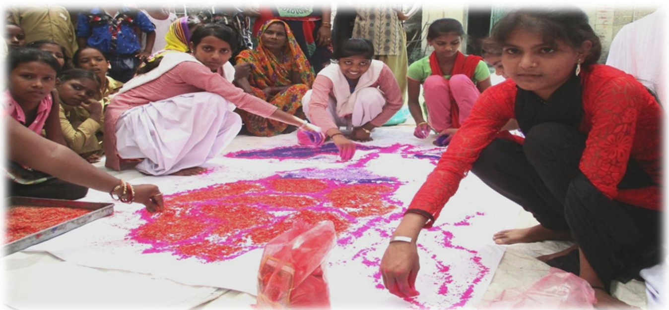
Group of adolescent girls making Rangoli during the programme "Beti ki Azadi"

To work for/with marginalized, stigmatized and excluded women, men and girls and boys to address their basic needs and enhance their quality of life