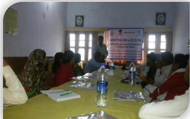
Capacity building on RTE and CFSS

Aim organized two days capacity building training on RTE and CFSS on 22 nd July to 23 rd July, 2016 at Hotel Pathik, Balrampur with the support of Actionaid and Unicef under Muskaan Project. The trainer was Mr. Ram Naresh, Lokmitra facilitated the whole session. Total 25 members participated in the training. The objective of the training was to make understand on RTE Act and make a better understanding of role of SMC and school process and decide on upcoming future plan. The participants do various activities and also make presentation on chart paper and discuss with other participants.