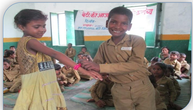
Breaking the tradition, boy tie Rakhi on Girl wrist

"Beti ki Azaadi" was organized from 19 th to 27 th August, 2016 at Primary School of 5 villages; Ranibehad, Kachiyani, Jalalpur, Kustaul and Muhammadpur of Block Mitauli District Lakhimpur Kheri. The various activities like meeting with SMC members and parents, celebration of