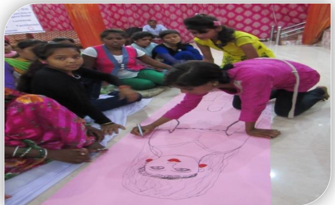
Girls making presentation on body mapping