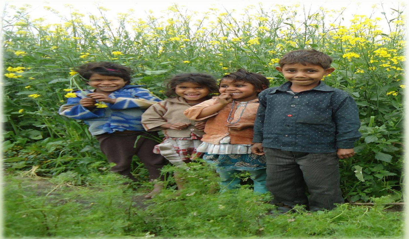
Children enjoying their rights

Aim Trust is working with children of marginalized community for ensuring their rights. AIM's focus is that every child should get the Right to Education. Children must know what is going in their society, what is their role in the society.