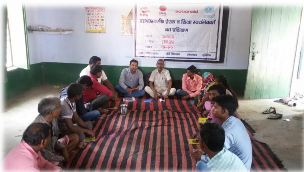
SMC Prerak and Education volunteer during Training in Balrampur