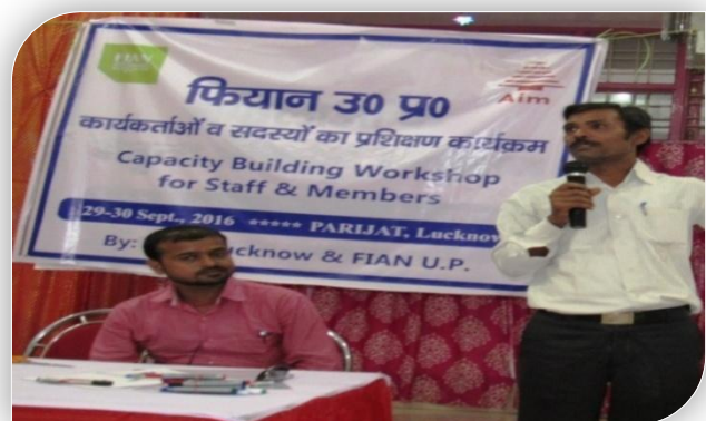
Workshop for staff and members

In two days session, the participants learn and discuss on about the schemes of government, the issues of ICDS center in Jalapur village, Kheri, the issue of displaced people from flood erosion, importance of organization, rights for blind people and how to fill RTI and write letter for any problems.