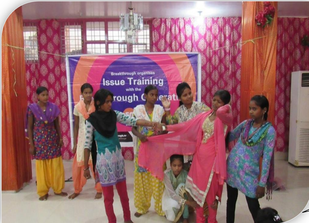
Adolescent girls play role of domestic violence act during training