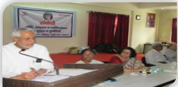
Mr. Rajendra Chaudhary, Hon'ble Minister, Cabinet Minister U.P Government

The main chief guests of this consultation were Mr. Rajendra Chaudhary, Honorable Minister, Cabinet Minister, Uttar Pradesh Government. He said that our mission should be based on peace, brotherhood, love and truth. But today's the situation