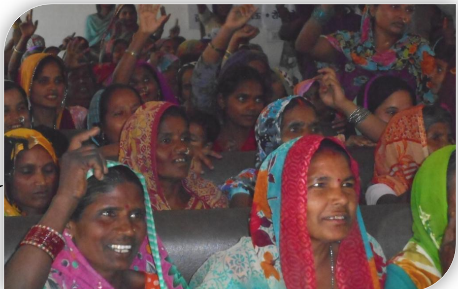
Women demanding their rights