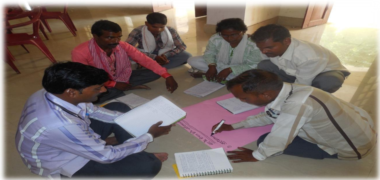
Participant makes presentation on Disaster Risk Reduction