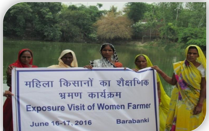
Exposure visit of women farmers

Total 15 women farmer's of different villages of Block Mitauli, Kheri participated in the exposure visit. This visit conducted in Block Masauli, District Barabanki. The team visited to the areas where the fisheries are done and learn the techniques about fisheries.