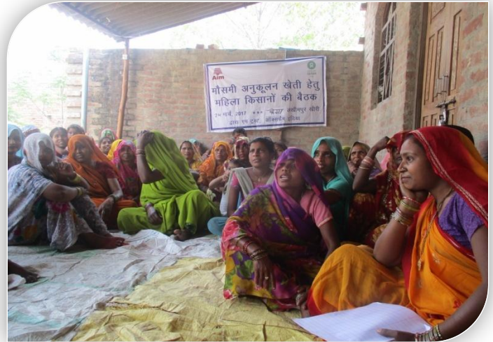
Women farmers during CRA Training

Aim with support of OXFAM organized a training programme for women farmers on Climate resilience agriculture. The training was organized on 24 th March, 2017 at Kaima village. The resource person in the training was Mr. Sunil Chaubey, Lucknow. He meet with women farmers at village to discourage the usage of chemical fertilizer and promotion of Indian Cow and Animal based natural farming practices among women farmers. AIM team members pointed out disadvantages of using hybrid seeds and chemical fertilizer in the crop field as desertification in soil, extra expenditure and health issues are commonly associated with chemical based agriculture. Total 51 women famers attended the workshop.