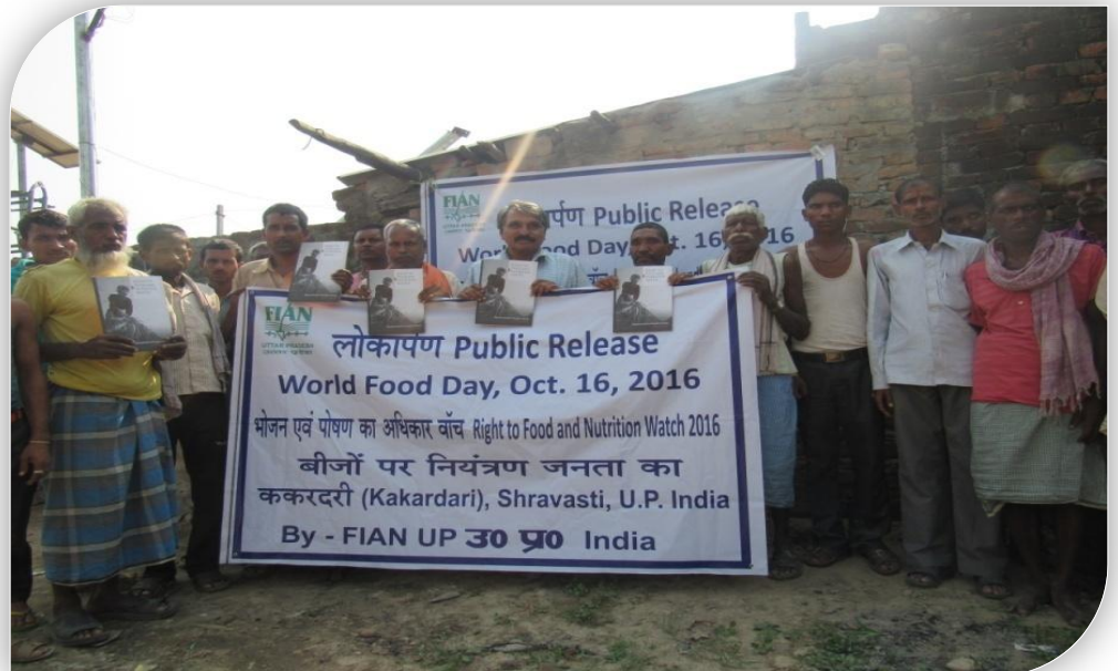
Release of Right to Food Nutrition Watch Report