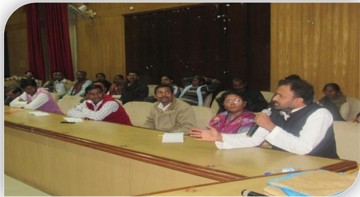
Participants during State level meeting for People Manifesto for U.P. Assembly Election 2017

A jointly state level meeting on People's Manifesto for U.P Assembly Election 2017 on the issues of land rights, housing rights, workers rights, women rights, children rights and dalit rights of vulnerable community was organized by People Advocacy Forum with the aim to including community demands like land, livelihood, housing, social security, water, dignity, governance, protections and security in political parties manifesto for upcoming election on December 7, 2016 at Jai Shankar Prasad Sabhagar, Lucknow.