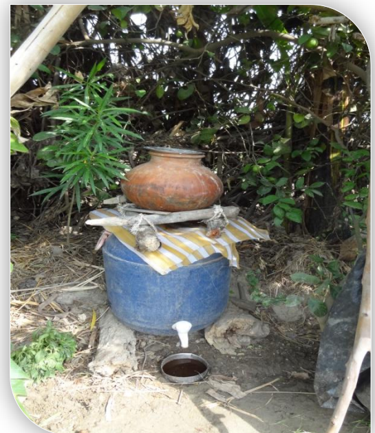
Preparation of bio fertilizer and bio pesticide by marginal women farmers

Farmers field school is the important tools for educate farmers. Aim facilitated 4 Farmer Field Schools (FFS) on the paddy crops in which 12 learning session was done on soil treatment, seed germination, SRI techniques and other CRA approaches and the same number in vegetable crop. Learning sessions were organized during various stages of crop cycle to capacitate women farmers for better crop management and developing understanding on various package of practices involved in CRA. Experts in the field of agriculture, agriculture department, KVK, agriculture scientists etc also visited field and interacted with women farmers. Total 788 farmers grown crops on CRA approaches among them female farmers are 512 and male farmers are 276.