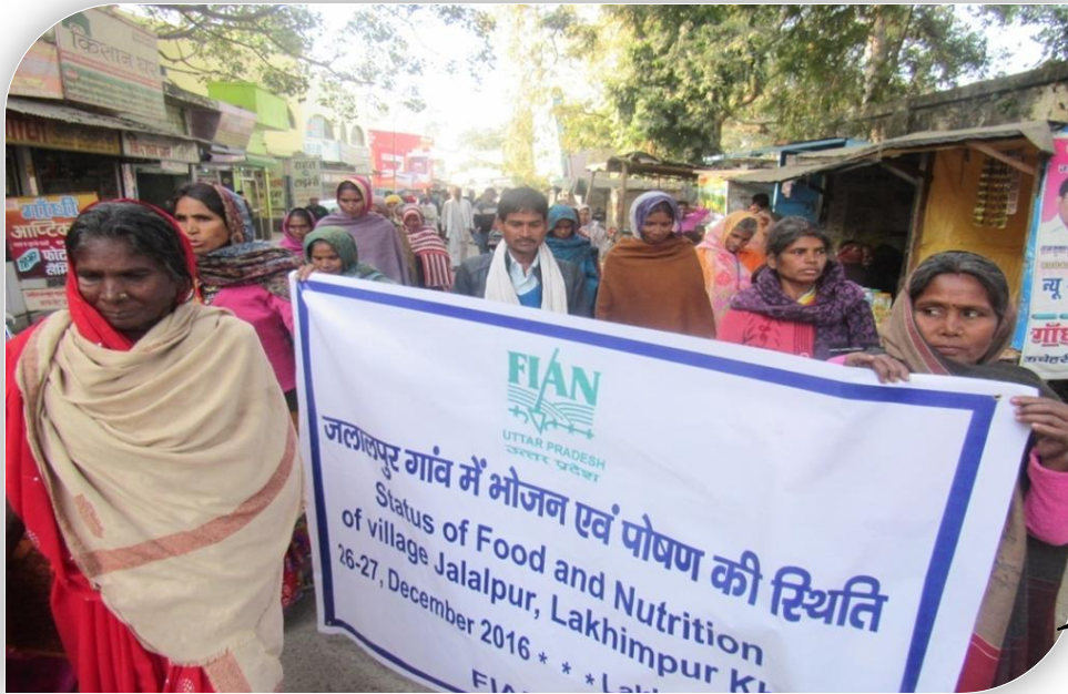
Campaign on Status of Food & Nutrition